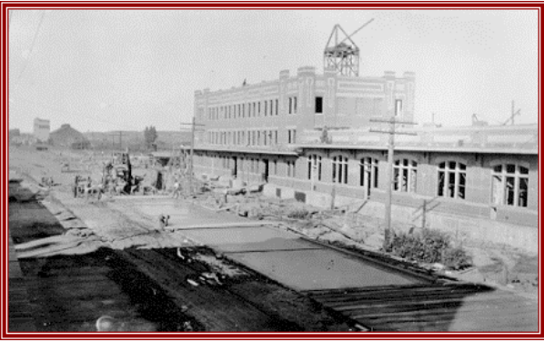
Asphalt roads come to America in 1870