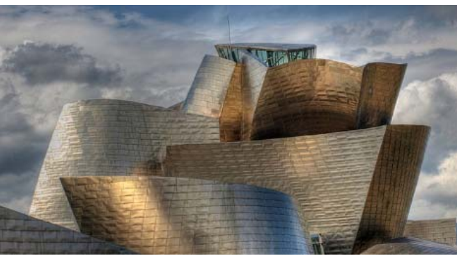
Guggenheim Museum Bilbao – Bilbao, Spain